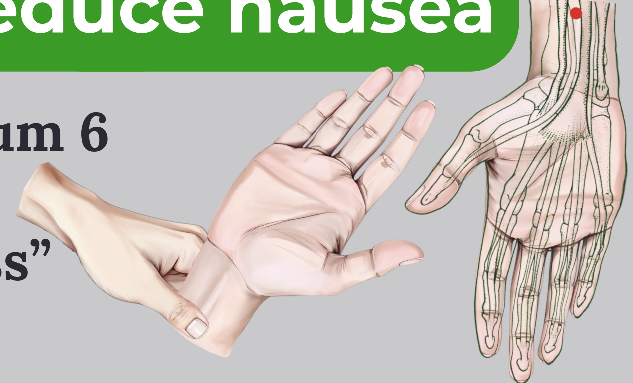
Paracardium 6 Neiguan “Inner Pass”

✓ Making a first, locate point , in depression where the tip of the pinky finger rests between the 4th & 5th finger. Press firmly with your thumb and gently massage for 1-2 mins .