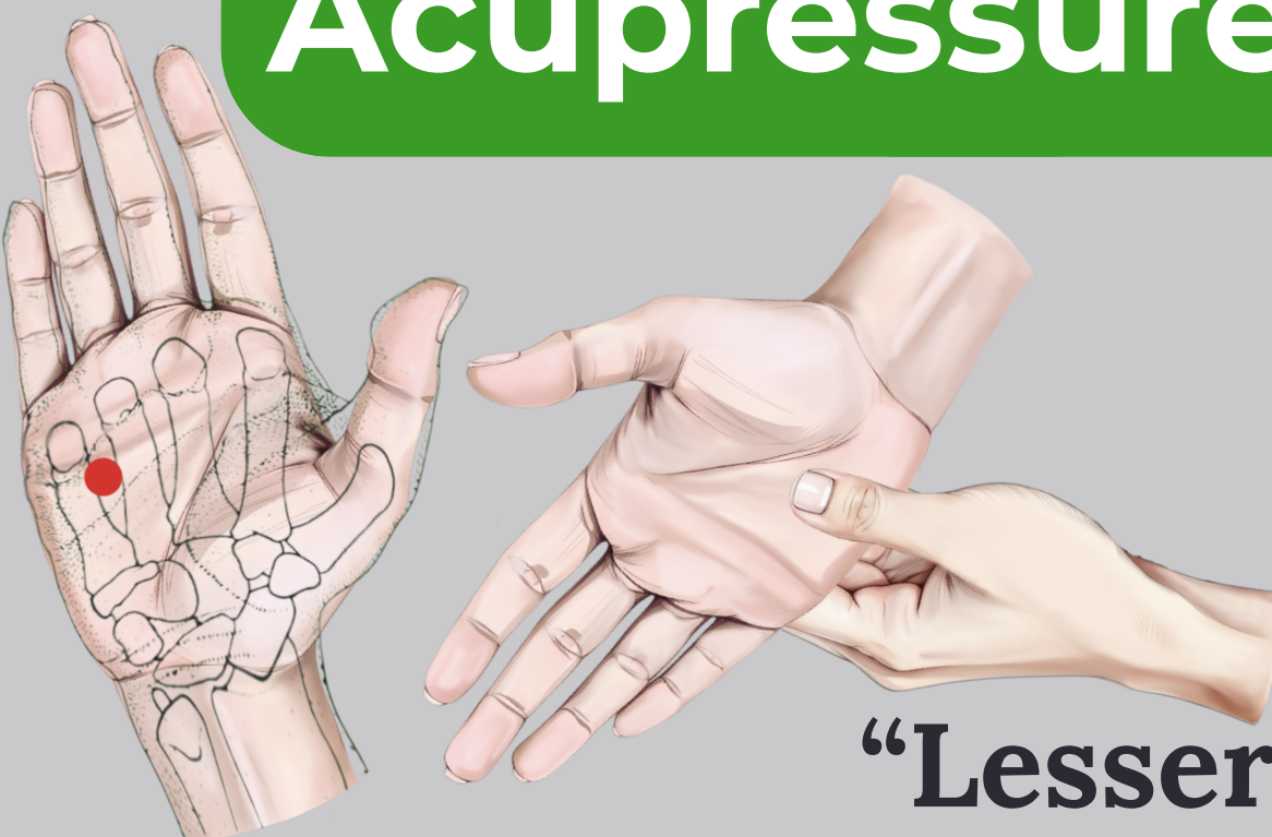
Heart 8 Shaofu “Lesser Palace”

Research shows that acupressure is a safe and simple technique with the ability to improve cardiovascular function, and reduce symptoms associated with insomnia, nausea and vomiting through calming sympathetic system responses and regulating physiological disruptions (Yang et al., 2016 & Liu et al., 2022).